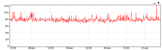
Figure 4: Delay of the Lightning maximum safe timestamp relative to an OLTP database in production at Google.

First, Lightning tries to minimize the impact on the OLTP database where it extracts changes. Because Lightning replicates a large-scale, geo-replicated OLTP database, it has several options for replicating changes. For example, Lightning could replicate changes as soon as they are committed to a single replica. However, this leads to substantial hotspotting on replicas that handle writes, with limited load on other replicas. Instead, Lightning replicates changes only after they have been committed to all replicas. This